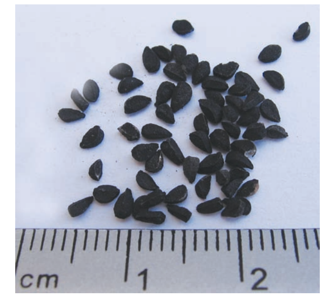
Plate 1: Nigella sativa seeds

Transverse section of seed shows single layered epidermis consisting of elliptical, thick walled cells, covered externally by a papillose cuticle and filled with dark brown contents. Epidermis is followed by 2-4 layers of thick walled tangentially elongated parenchymatous cells, followed by a reddish brown pigmented layer composed of thick walled, rectangular elongated cells. Inner to the pigment layer, is present a layer composed of thick walled rectangular elongated or nearly columnar, elongated